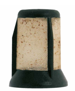
Prefilter of the E3T – blocked by rust

Most modern fuel pumps are flushed through with fuel, which lubricates and cools them. If this does not happen to a sufficient extent, e.g. through soiling, there is a risk of "dry running". Fuel pumps in the E1F, E2T and E3T series are equipped with a built-in prefilter on the intake side. This small prefilter provides protection against contamination. It can become blocked due to dirt in the intake air. The fuel pumps are suitable exclusively for petrol.