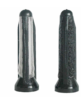
Prefilter of the E1F: new on the left, blocked on the right